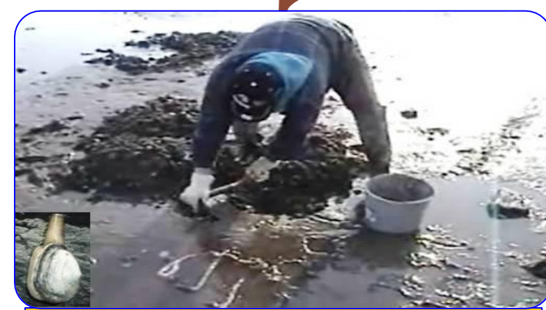
Bay of Fundy Marine Resource Centre(MRC): Historical Clam Fisheries Study

University of New Brunswick (UNB) & (MRC)