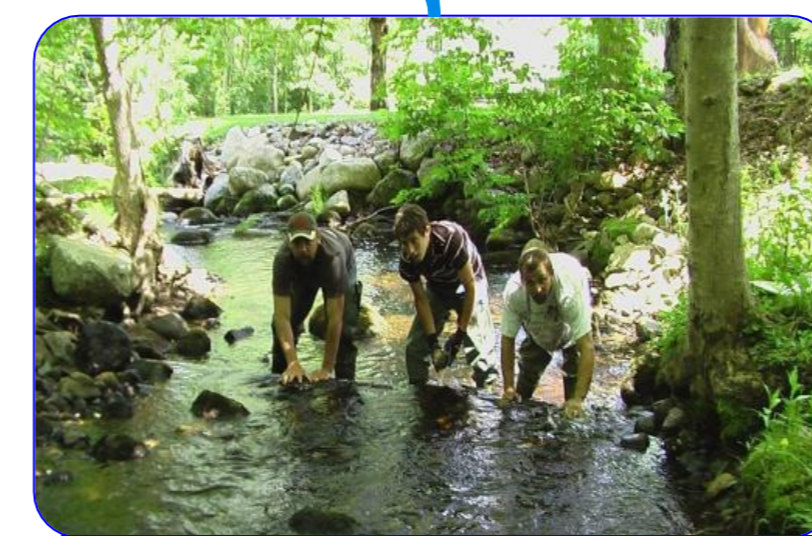
Bear River First Nation (BRFN): Stream Restoration

Fundy Fixed Gear Council (FFGC): FFGC Ten Year Reflection Paper