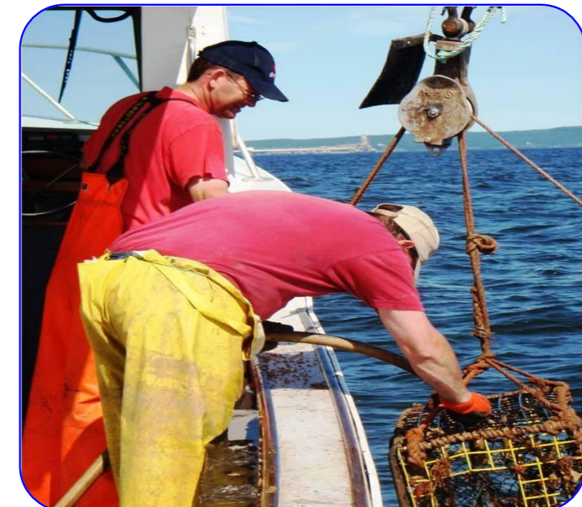
FNFA: Lobster Conservation-Trap Recovery Project