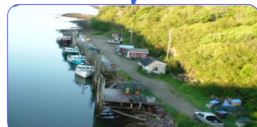
Fundy North Fishermen's Association (FNFA): Film "Sharing the waters"

Journal Article: Clam Fishery Governance