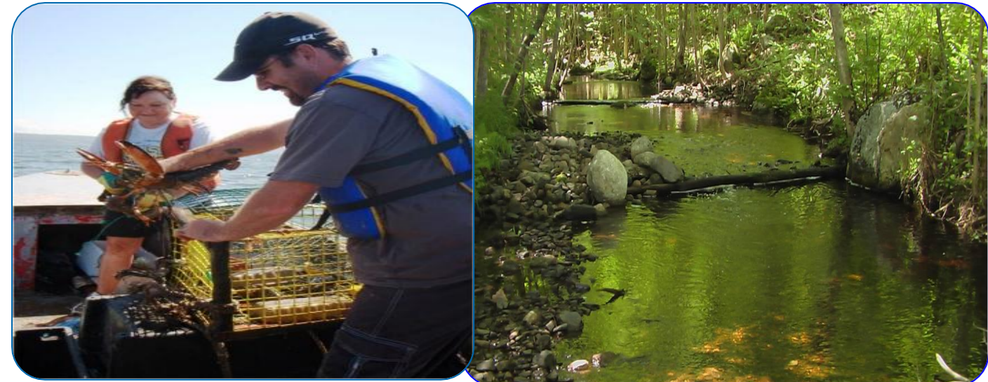
BRFN: Community Resource management