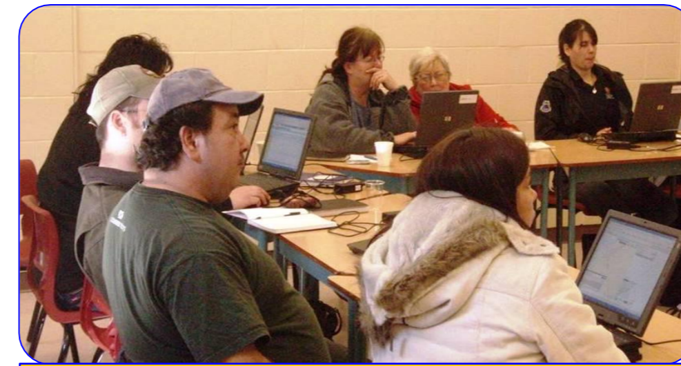
MRC/MCPEI/SMU/FFGC & BRFN: GIS Community Workshops & Learning Circles

UNB/FNFA High School Education Program: Saint John Stakeholder meeting